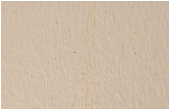
Detail of wall texture